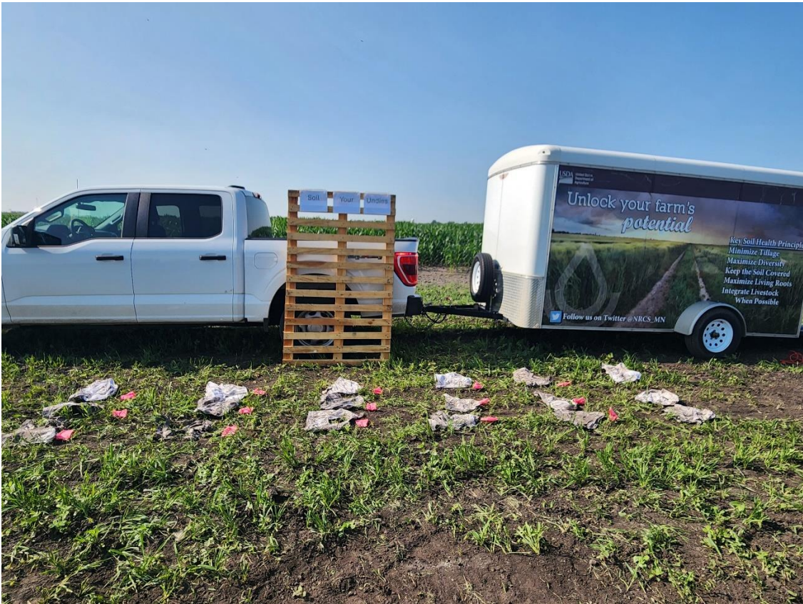
2024 Soil Your Undies display