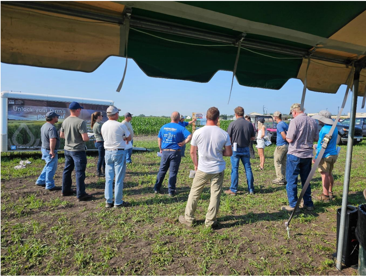
Field Day – NRCS Demonstrations(above) & Live Equipment Demonstrations(below)