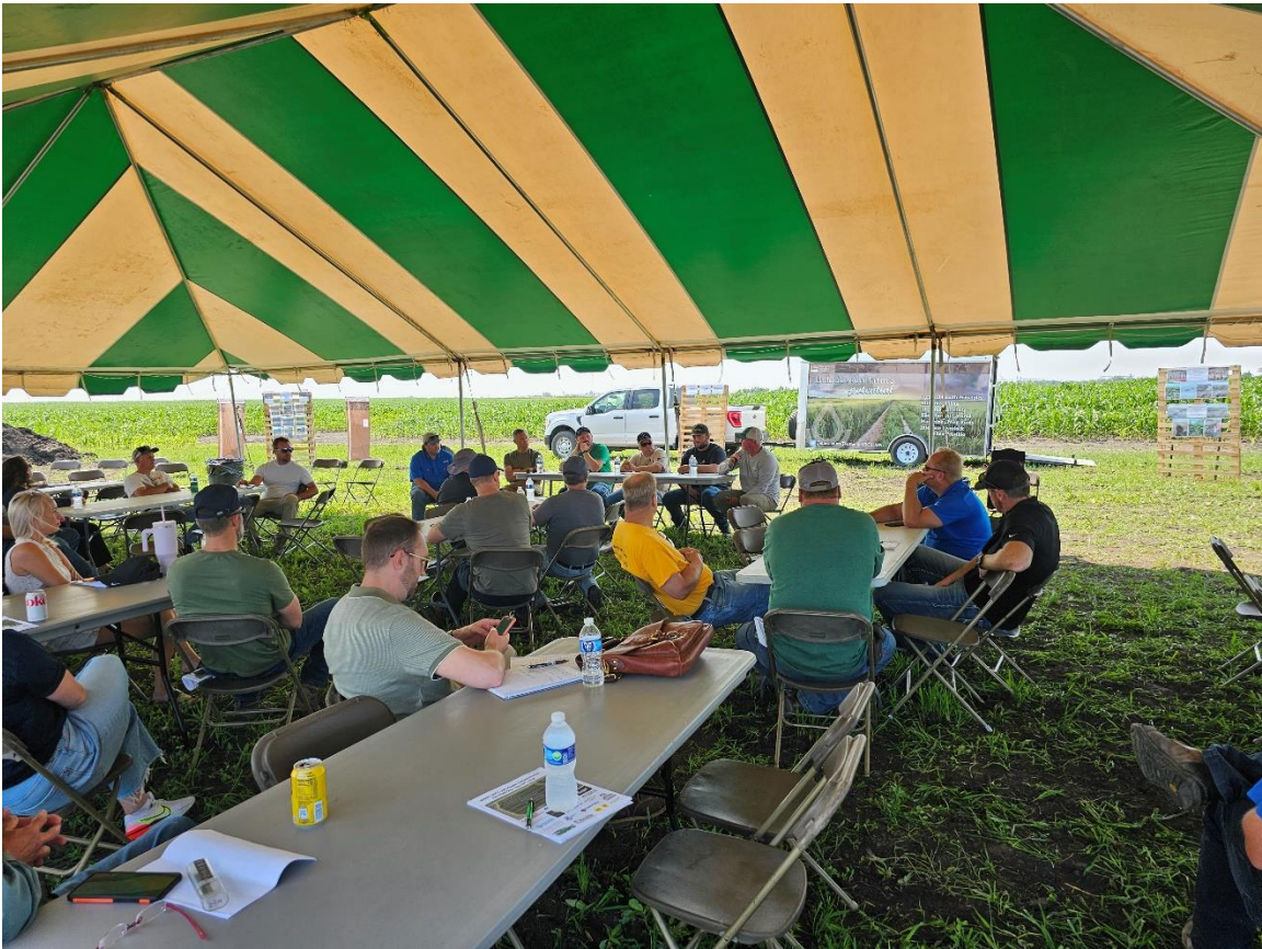
Field Day – Farmer Panel